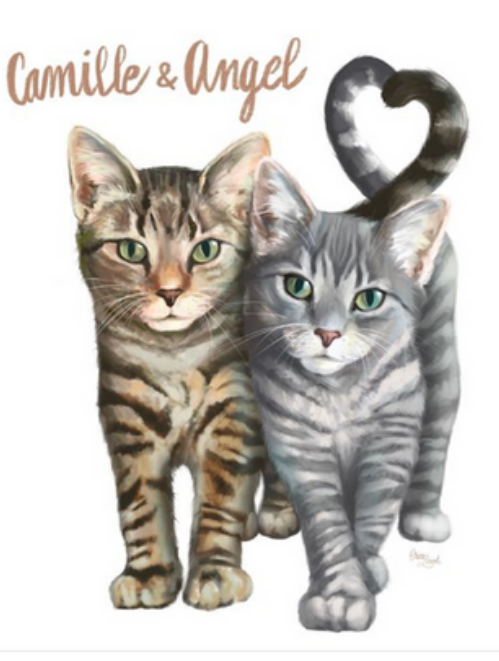
The FOREVER HOME characters: Camille and Angel

The learning objectives and specific skills for this guide were based on the Massachuetts Guidelines for Preschool and Kindergarten Learning Experiences. Learn more at: <u>https://www.mass.gov/service-details/guidelines-for-preschool-learning-experiences</u>